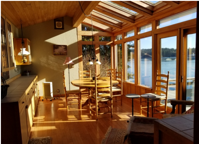
Built in cabinets and quality craftsmanship