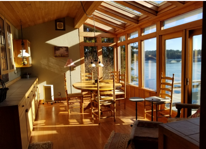
Built in cabinets and quality craftsmanship