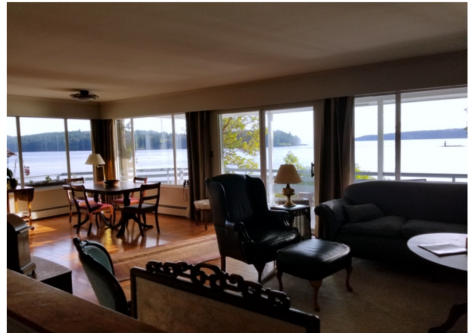
Spacious living room combined with dining area.