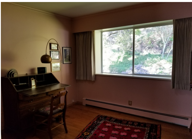
3rd bedroom on the main floor. Hardwood flooring throughout.