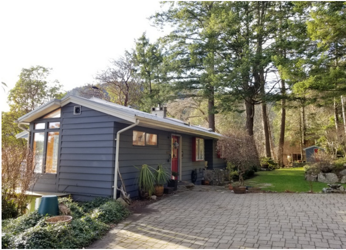
All principal rooms are on the main floor. Excellent floor plan.