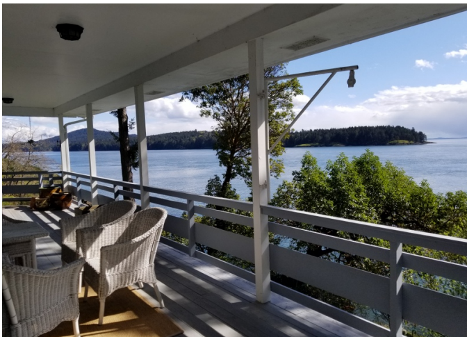
The perfect home to entertain family and friends.