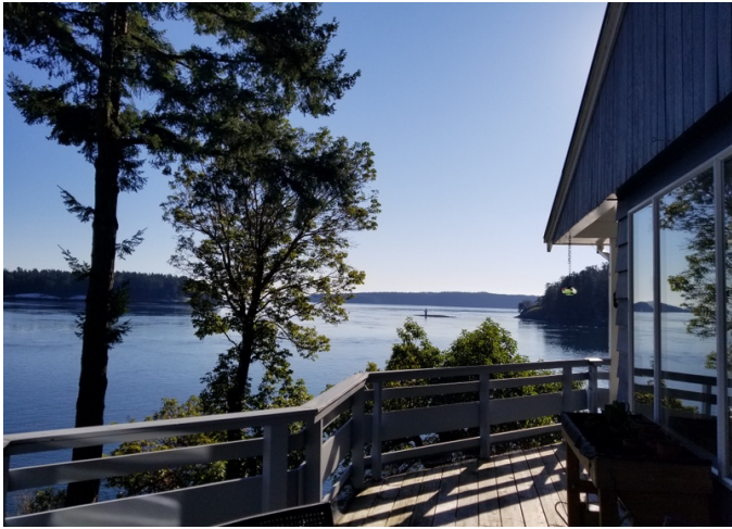
Southern exposure. Full sun in the winter..