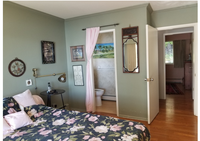
Master bedroom and 2 piece ensuite