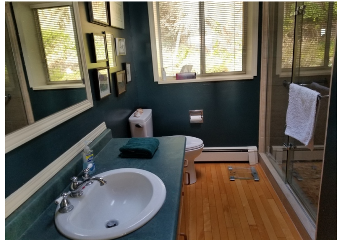
3 piece bath on the main floor with walk in shower. .