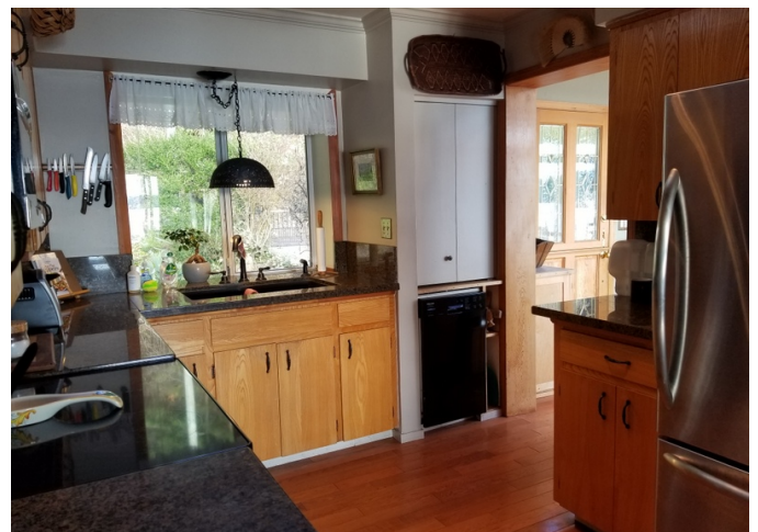
Kitchen that is connected to the sunroom, living room and and dining area.