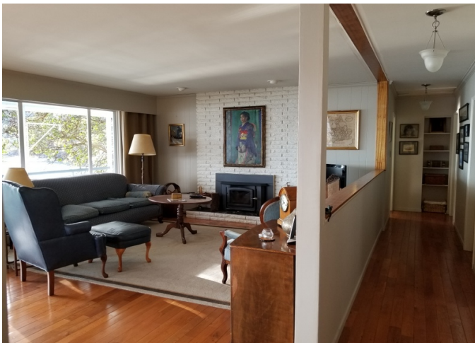
Efficient fireplace insert in living room.