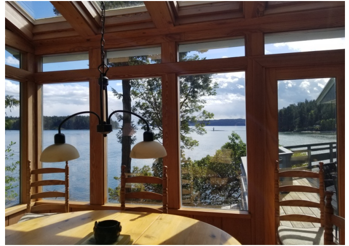
The best room in the house. Especially in the winter, when the sun lights up the the whole room.