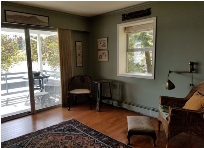
Master bedroom has access to the covered deck that runs the entire length of the home.