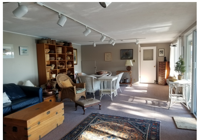
Recreational room on the lower level. Wood stove. Access to the lower deck.