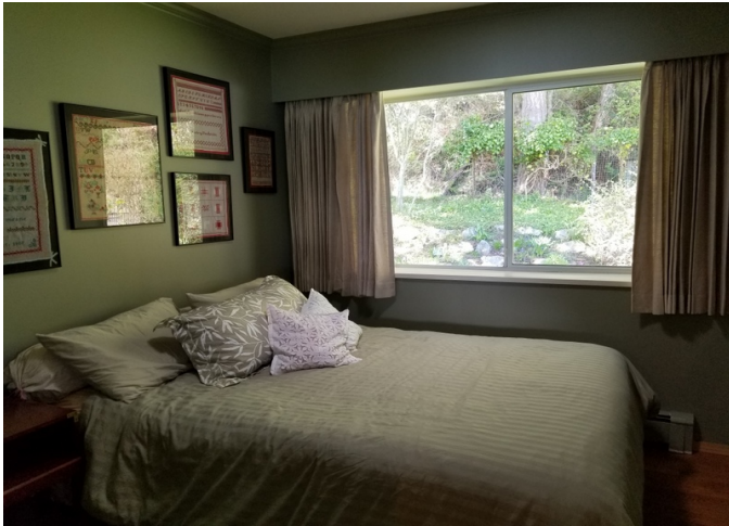
Guest bedroom overlooking the garden.