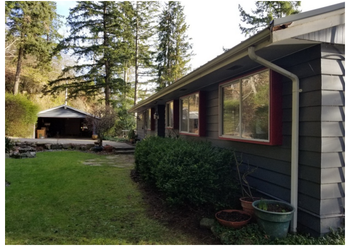
Entire property is fenced. 2 car garage by the house.