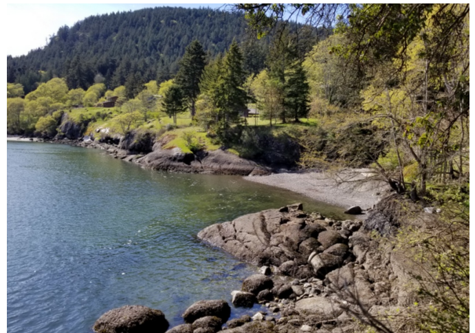
Lovely views of Georgeson Bay, the beaches and Mt Galiano in the distance.