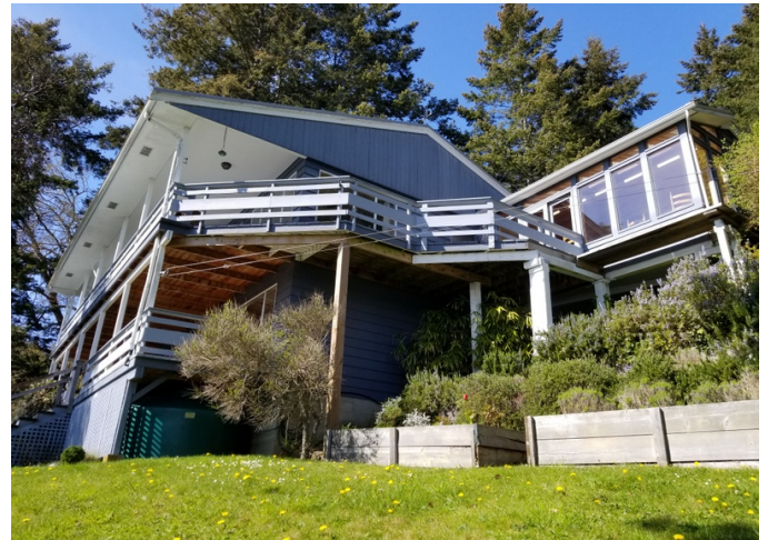
2 tier covered seaside decks. Mediterranean microclimate allows for gardening all year.