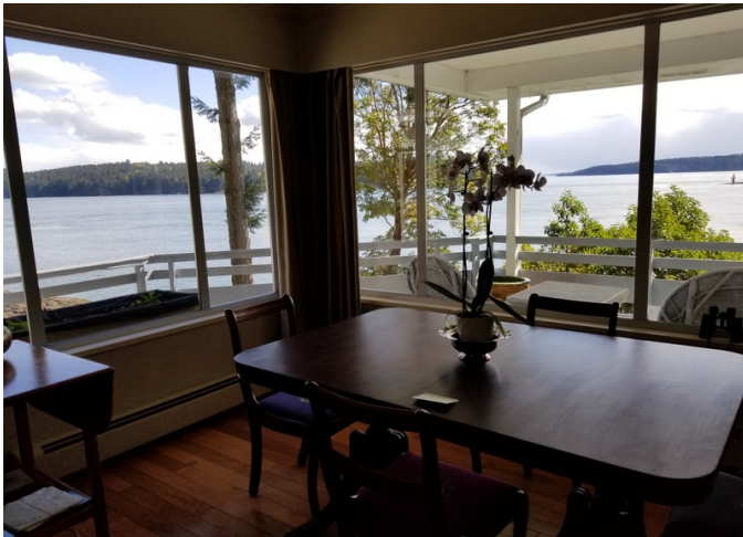
A good place to watch the comings and goings in Active Pass