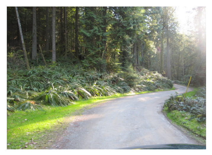
Roberts Road at Therah.