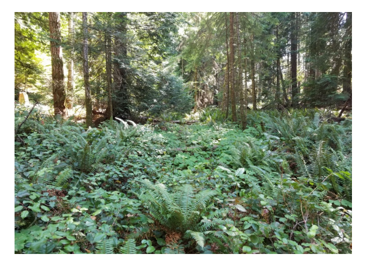
Access to the property is off Roberts Road.