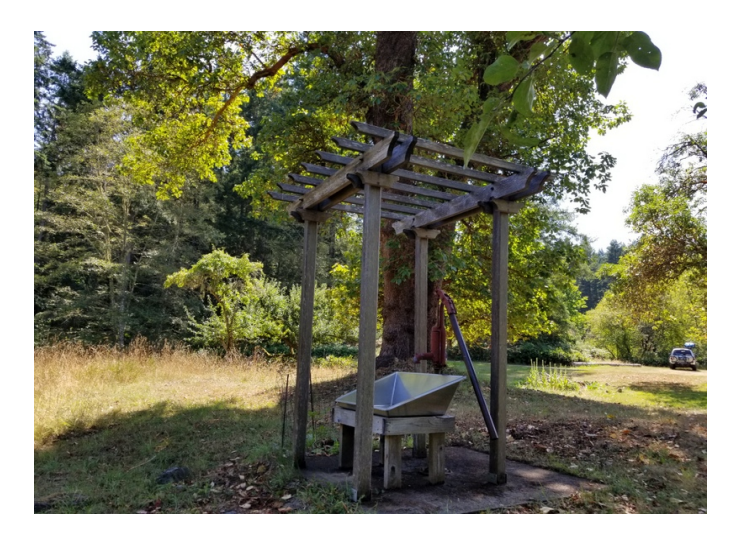
A hand pump is attached to the common well adjacent to the communal building.