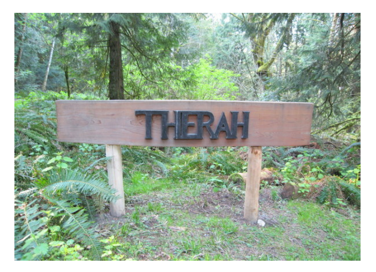
Welcome to Therah Village. Cook Road off Porlier Pass Road takes you there.

Office - 23 Madrona Drive (near ferry terminal) - Galiano Island, BC, V0N 1P0 - 250 539 2250 Information is from sources believed to be reliable but should not be relied upon without verification