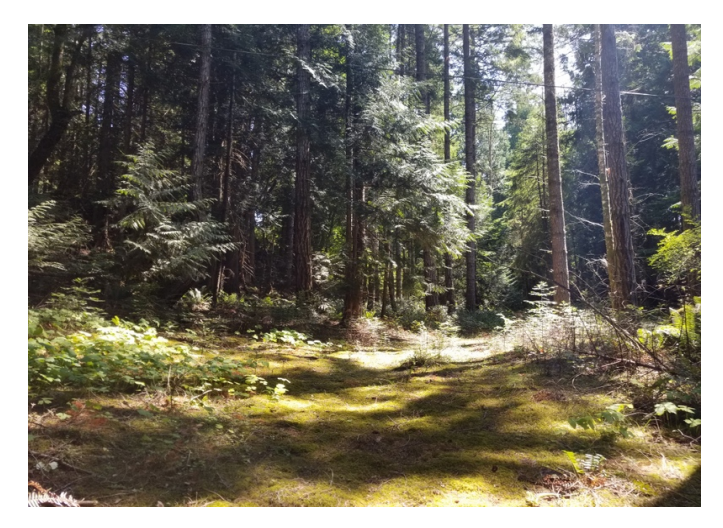
Beautifully forested land. A ridge to the east provides utmost privacy.