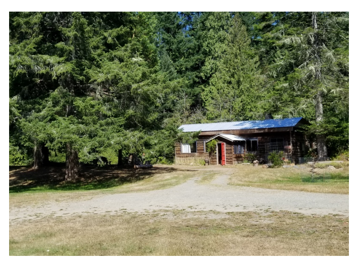
Communal building in the heart of the fertile valley.