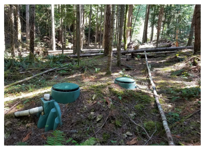
Septic system has been installed.

Land is located on a plateau overlooking a valley to the west.