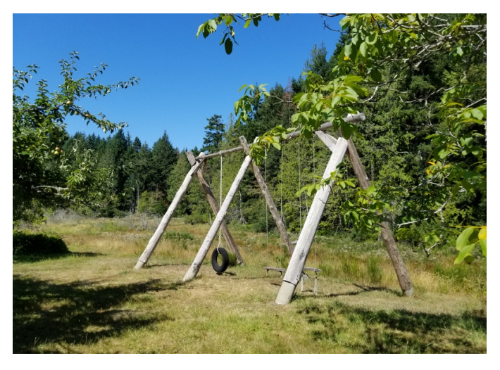
Playground in the common area.