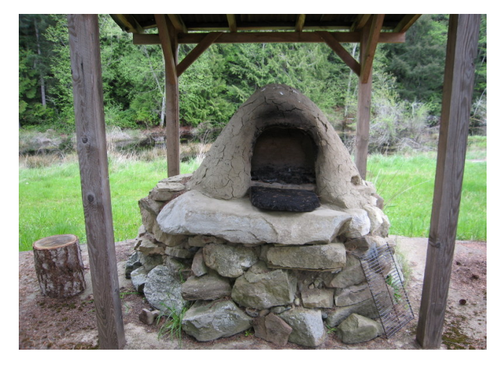
Baking oven in the communal area.