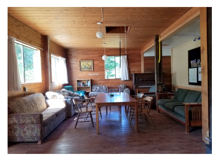
Meeting room comes with a piano.