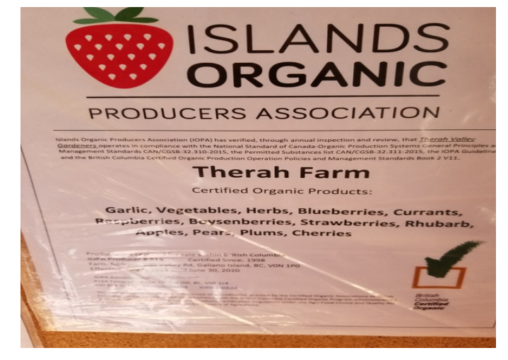
Therah Farm has received Organic Status.

Several gardens are established in the valley, one of the common areas of Therah.