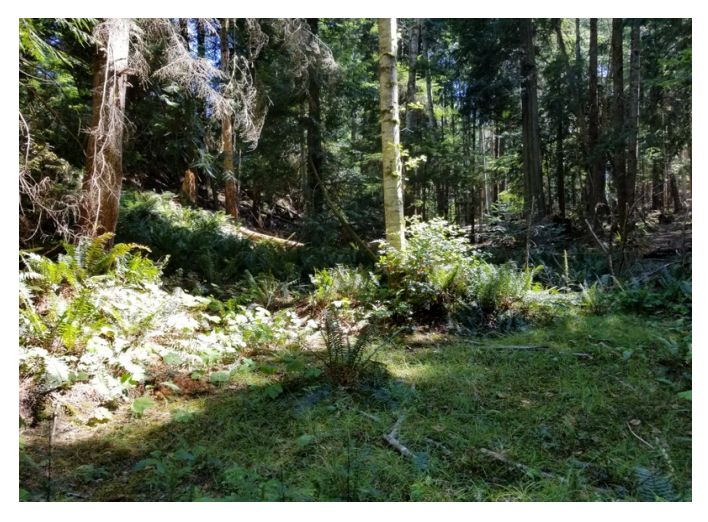
Several building sites to choose from.