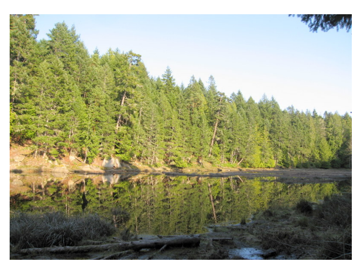
Lake Kincaid is home to many birds.