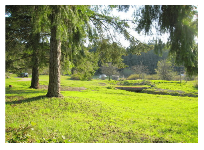
Great biodiversity can be found at Therah. From wetlands to lush meadows to magnificent forests.

Open, sunny surroundings with a well established orchard.