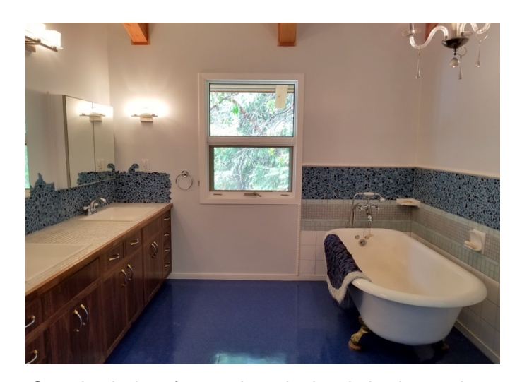
Oversized claw foot antique bath tub in the 5 piece ensuite. Walnut cabinetry and double sinks.