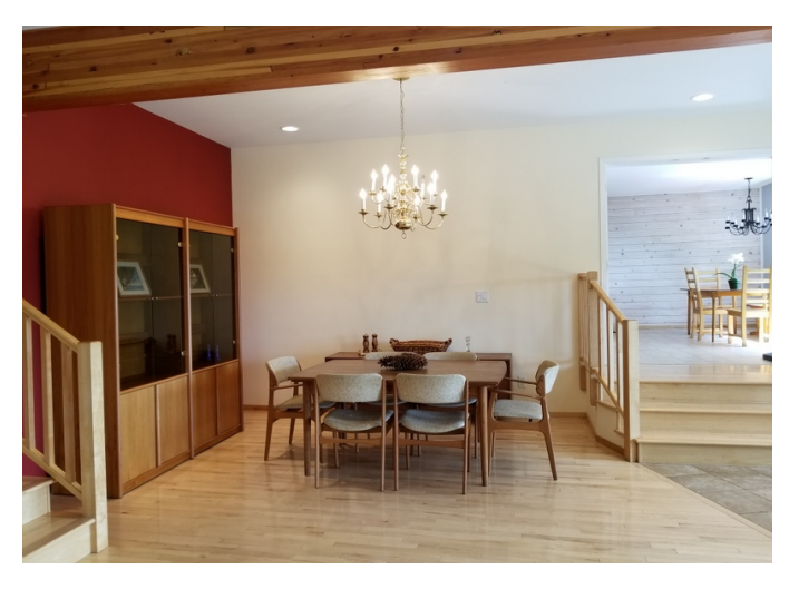
In floor radiant hot water heating throughout the house. Eastern maple floor in dining/living room.