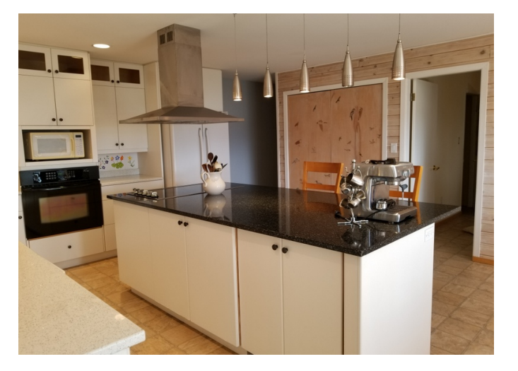
Chefs will love this modern kitchen with separate pantry. Quartz counter tops and handpainted tiles