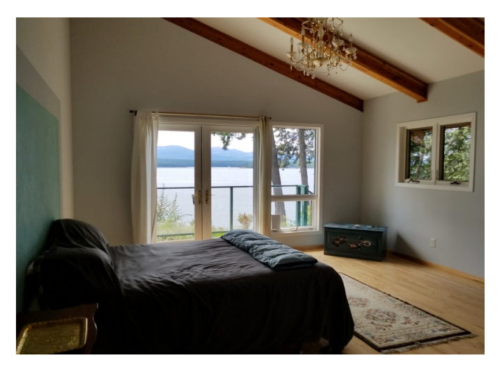
2nd master BR; access to the seaside balcony to enjoy unparalleled ocean and mountain views.