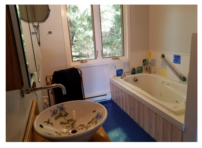
Cork flooring in both 4 piece ensuites for the upstairs master bedrooms.