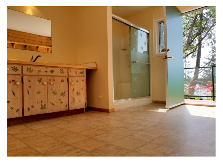
Mud room with handicap accessible double walk-in shower and separate toilet.