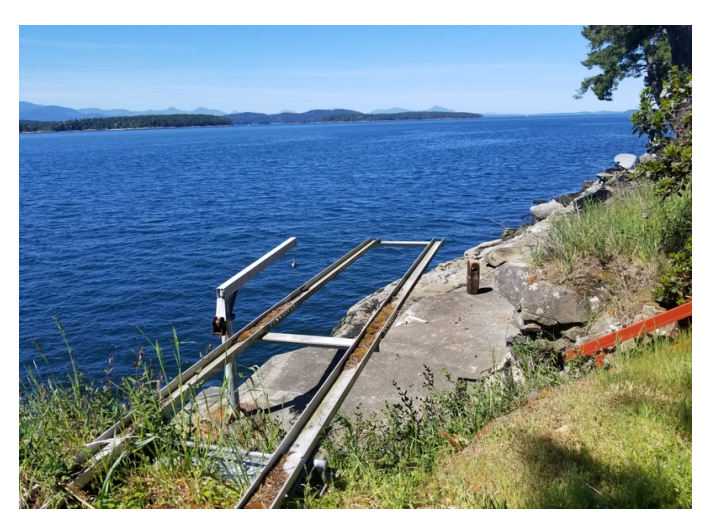
Boat launch and lift. View to the west and northwest. Short stair case down to the cemented pad.