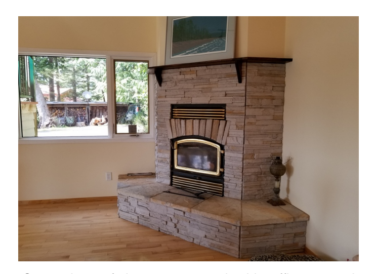
Centerpiece of the great room is this efficent wood burning fire place.