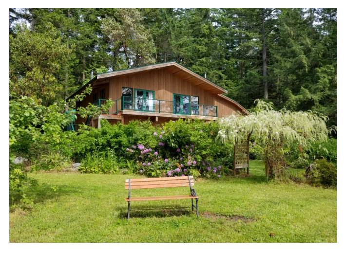
Lovely yard with mature shrubs, flowering bushes and fruit trees.