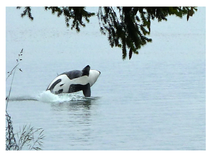
Visitors showing off in front of the property.