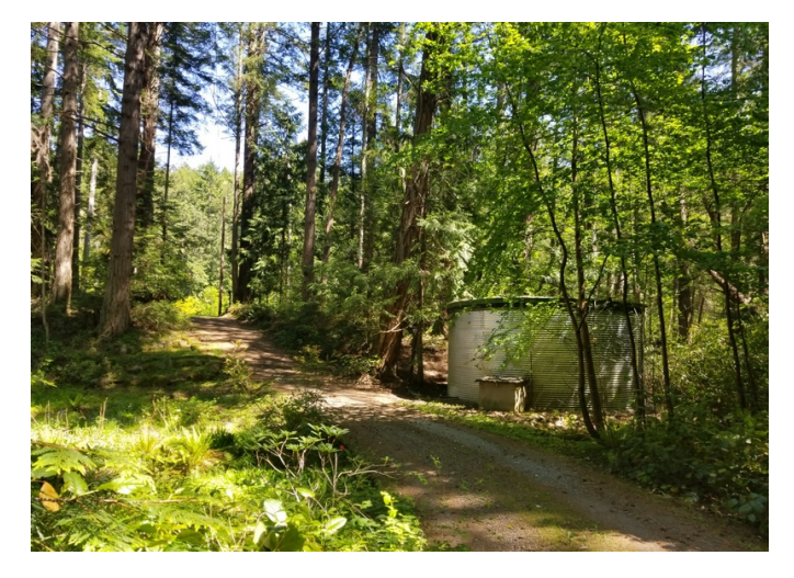
A 25,000 gallon water tank and several smaller tanks to be used for fire fighting and irrigation.