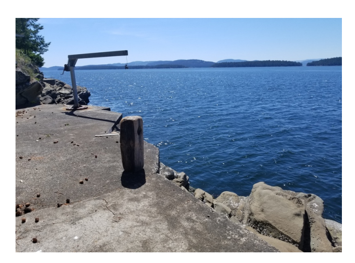
Flat cemented boat launch. Panoramic view to the south of Trincomali Channel.