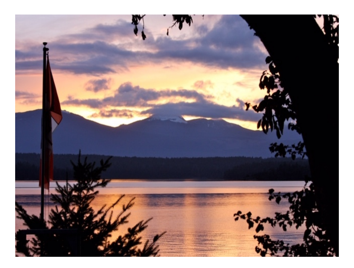
Sunsets can be admired year round due to its southern, western and northwestern exposure.