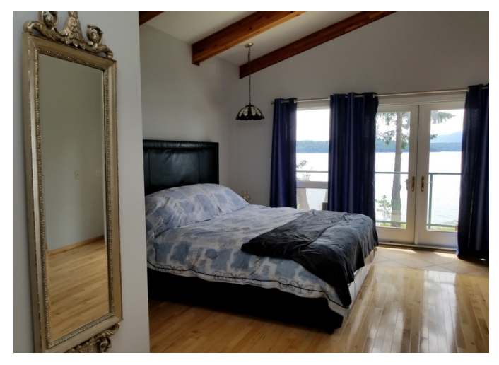
One of the 2 master BR upstairs. Both have maple flooring, vaulted ceiling, walk in closets.