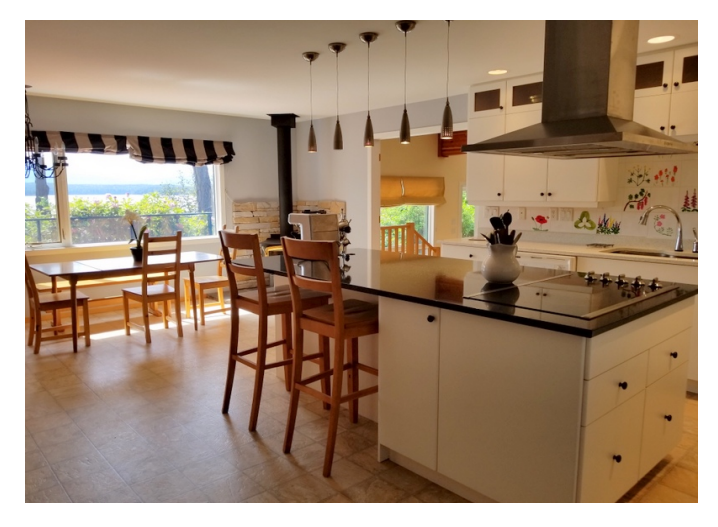
Eating area with wood stove in the corner. Plenty of seasoned firewood in the woodshed.