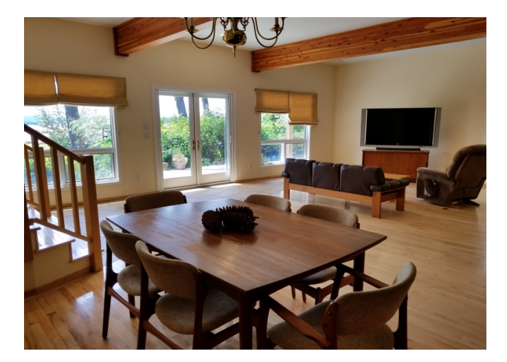
3,200 sqft custom crafted home, post and beam style with 10 foot ceilings in the great room.