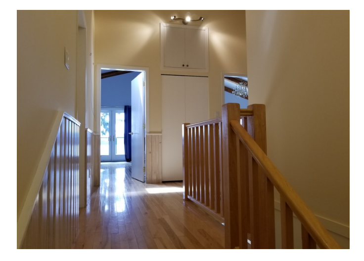
Exquisitley crafted maple stair case and wainscotting. Quality finishing throughout the house.