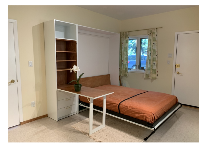
On the main floor: one of the 2 Murphy beds to maximize floor space in the guest bedrooms.