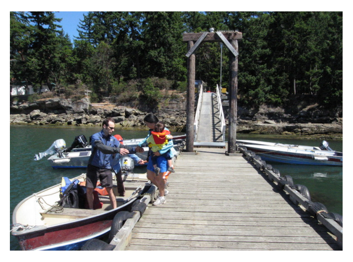
A short ride in sheltered waters takes you to the community dock on Gossip Island