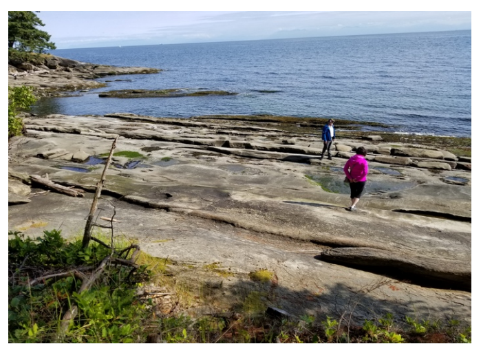
Expansive and very attractive walk on sandstone beach in front of your property