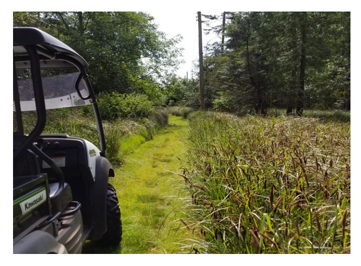
Getting around on the island highway.