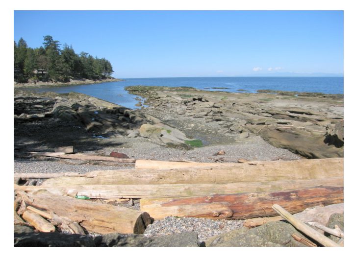
A delightful beach and look out point at the eastern end of the bay.