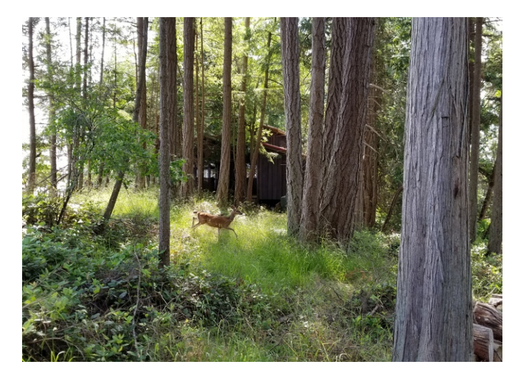
On the land.