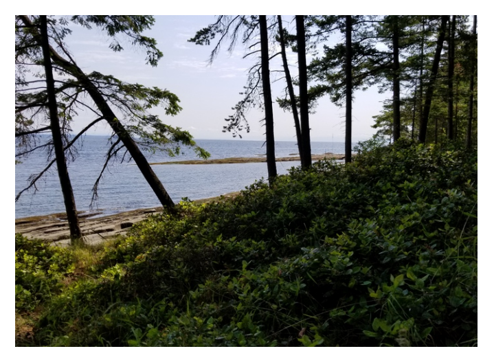
View from property over Georgia Strait.