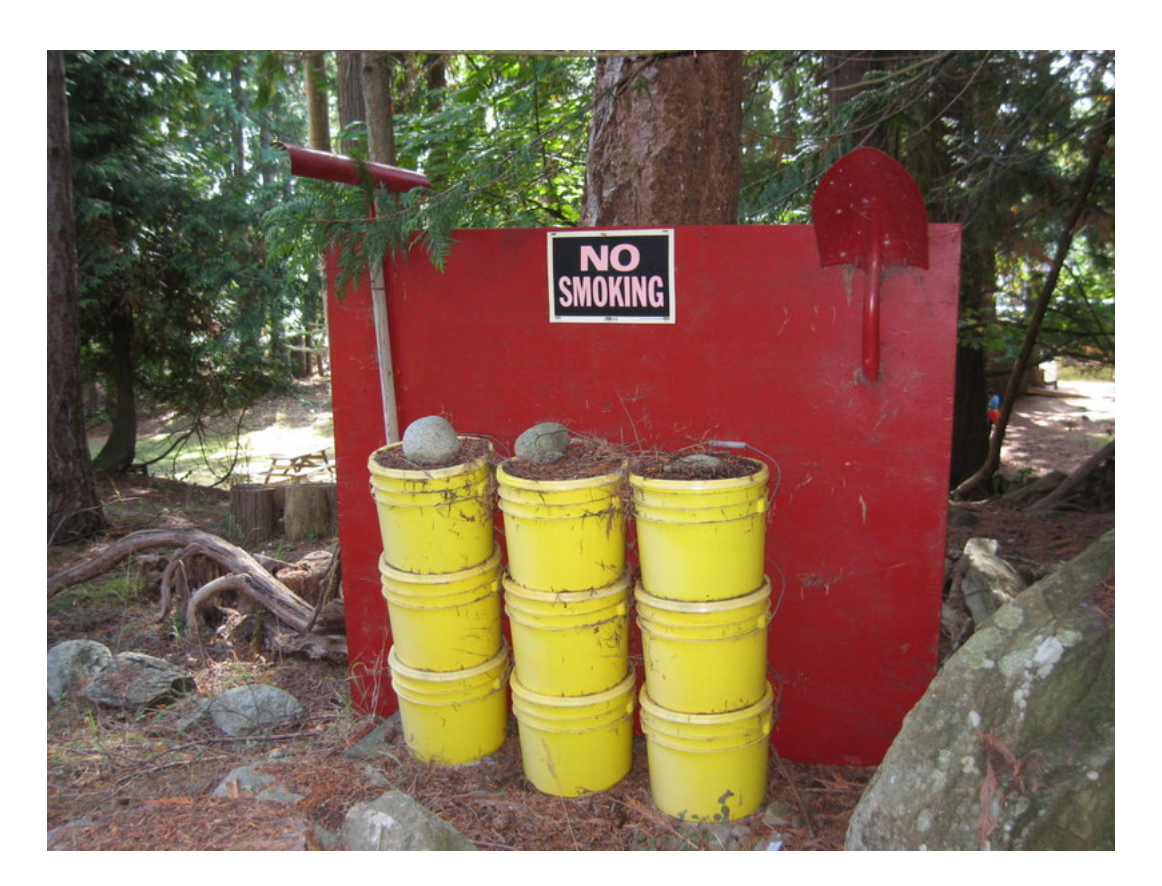
Just in case. Firefighting equipment is always accessible.