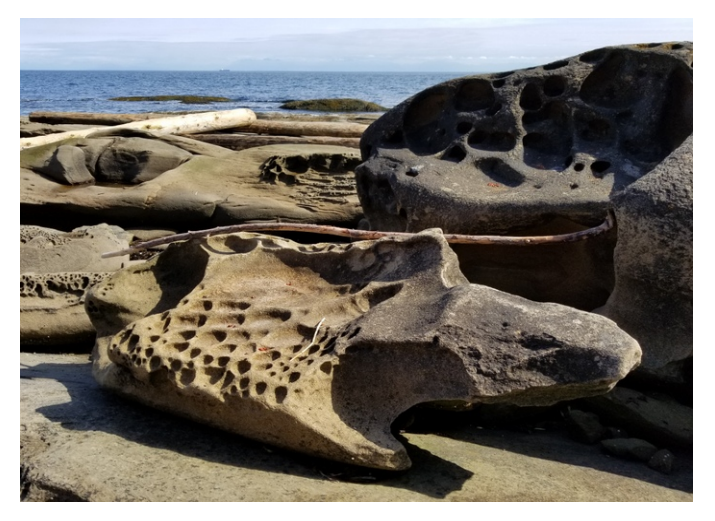
The sandstone beach is truly a delight for the photographer.