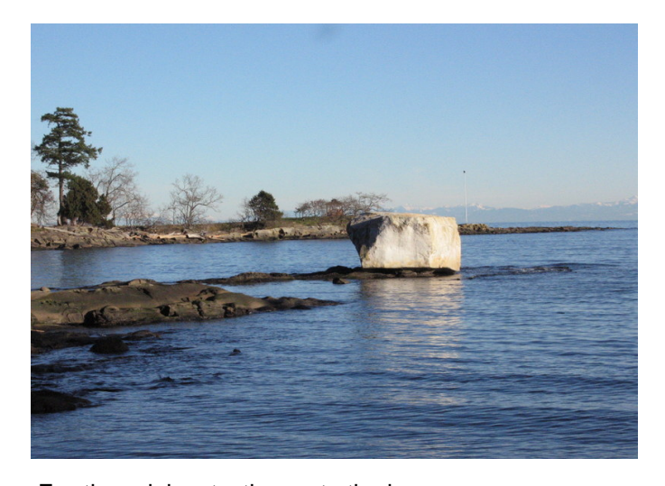
Erratic rock is a testimony to the ice age.