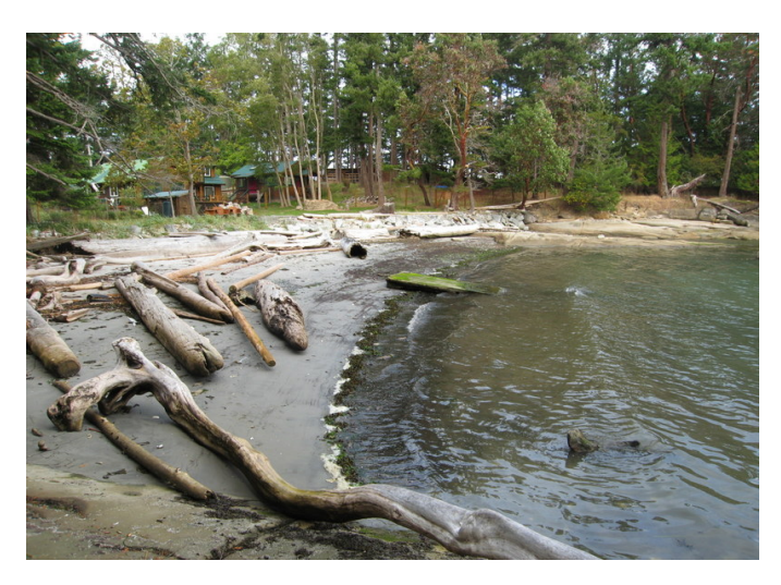
Sandy swimming beach is a welcome playground for kids.