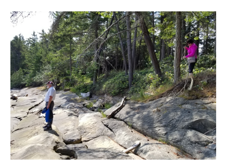
Easy access to the vast shoreline from the property.