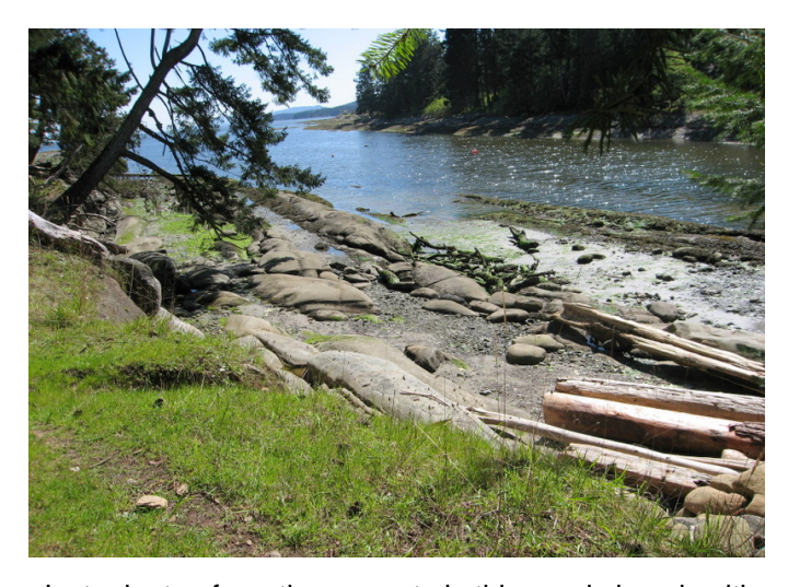
Just minutes from the property is this sandy beach with public access.