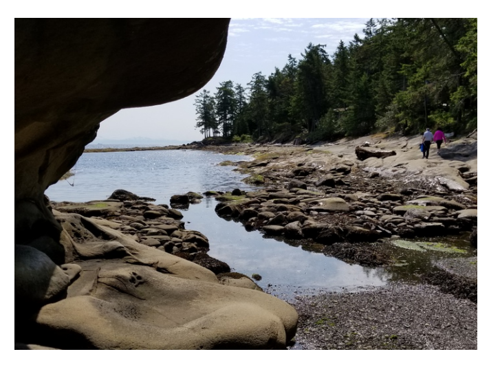
Look for your favourite piece of driftwood.