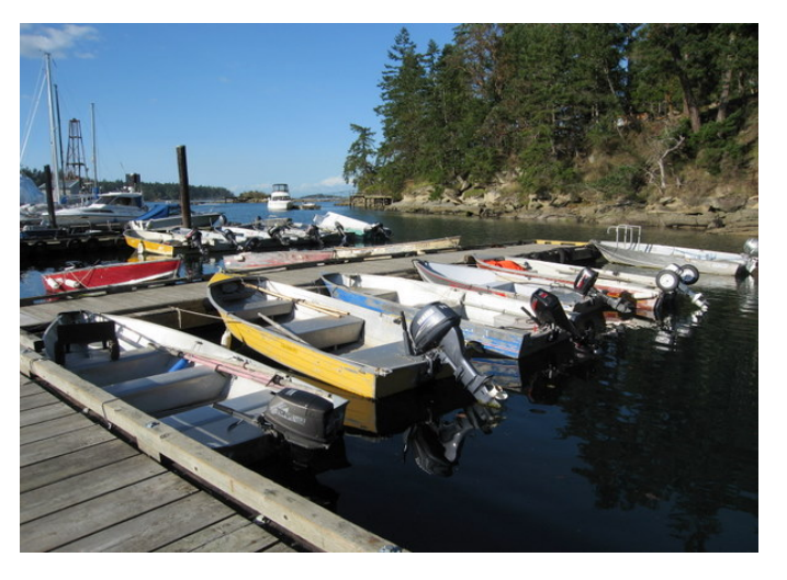
These bays are reserved for the Gossip Islanders at the Whaler Bay government dock on Gaiano. .