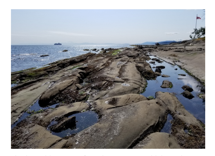
At low tide, a reef and numerous tidal pools are exposed.