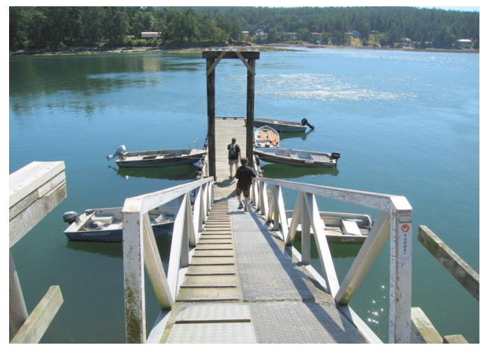
Property has a share in the community dock on Gossip Island.